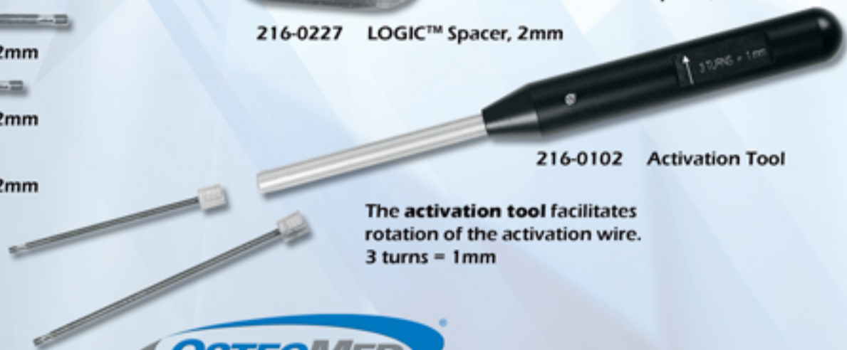
216-0102 Activation Tool

The activation tool facilitates rotation of the activation wire. 3 turns = 1mm